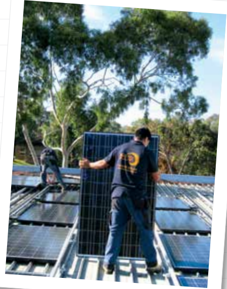
Solar contribution to electricity costs since installation (8 months)

Electricity cost reduction by 43%. 14% return on investment.